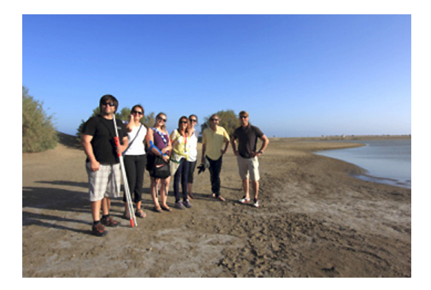
Image 5: Bioprospecting partners from Chile, Spain and Norway at a joint sampling event in May 2014 at Charca Maspalomas, Canary Islands.