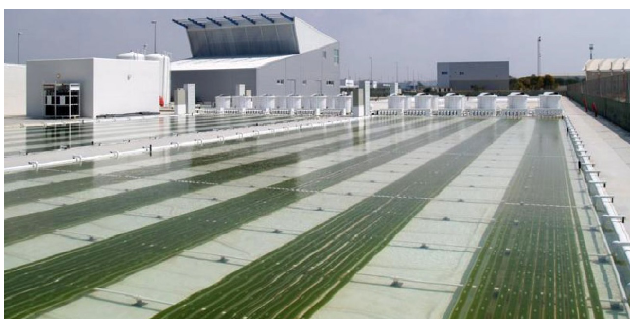
Image 8: Algae cultivation facilities at Fitoplancton Marino SA (SPAIN)

At the end of the project, at least four integrated value chains are expected to be demonstrated.